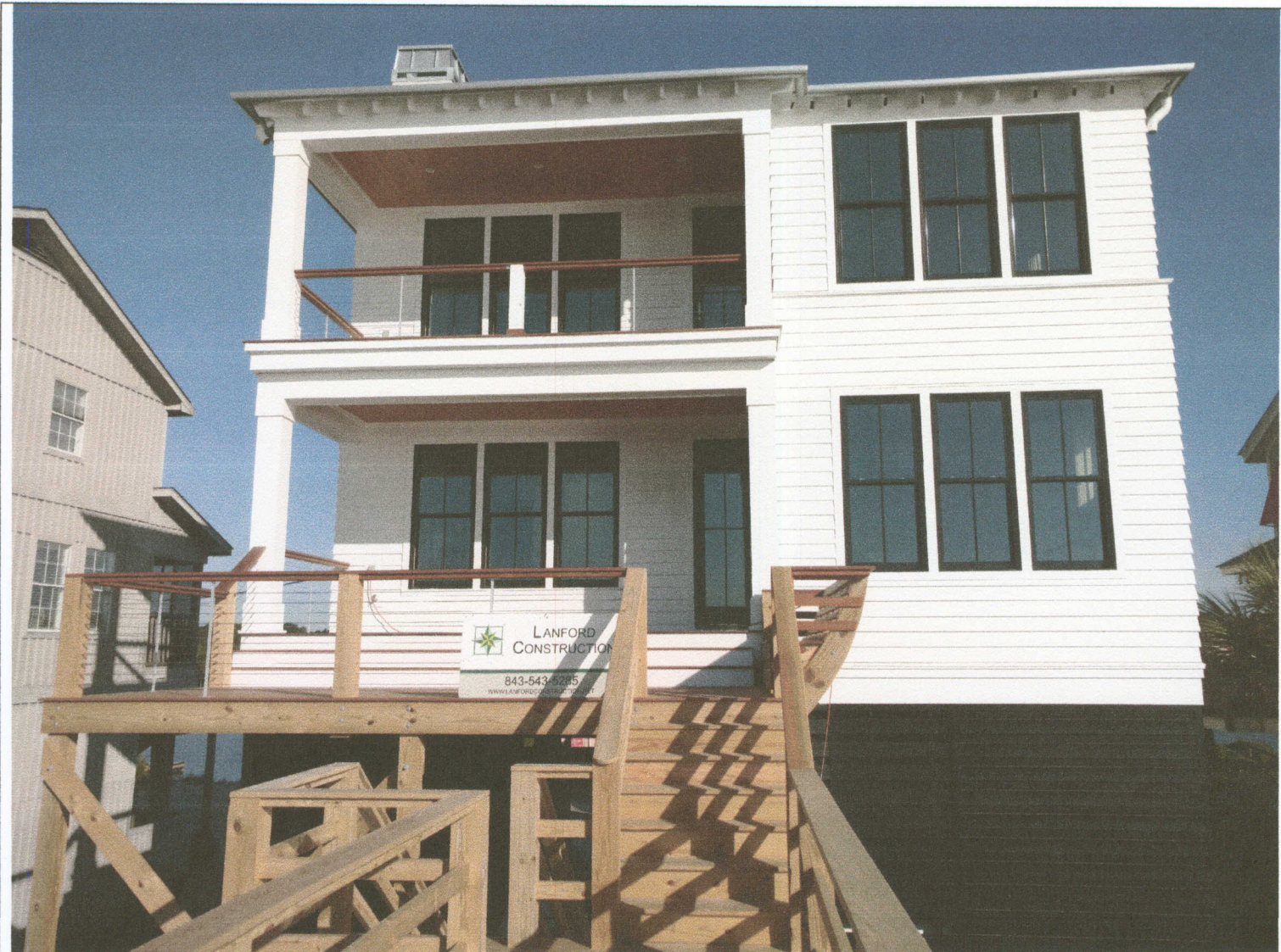
Rear view (Ocean Side): 06/08/16

If submitting more photographs than will fit on the preceding page, affix the additional photographs below. Identify all photographs with: date taken; "Front View" and "Rear View"; and, if required, "Right Side View" and "Left Side View." When applicable, photographs must show the foundation with representative examples of the flood openings or vents, as indicated in Section A8.