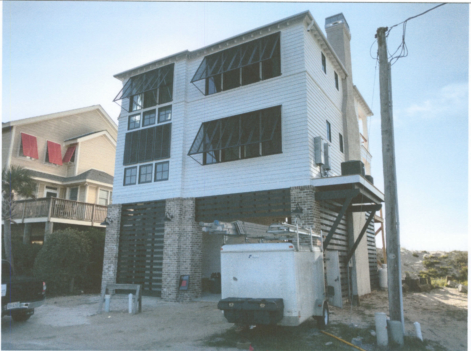
Front view (Street Side): 06/08/16

If using the Elevation Certificate to obtain NFIP flood insurance, affix at least 2 building photographs below according to the instructions for Item A6. Identify all photographs with date taken; "Front View" and "Rear View"; and, if required, "Right Side View" and "Left Side View." When applicable, photographs must show the foundation with representative examples of the flood openings or vents, as indicated in Section A8. If submitting more photographs than will fit on this page, use the Continuation Page.