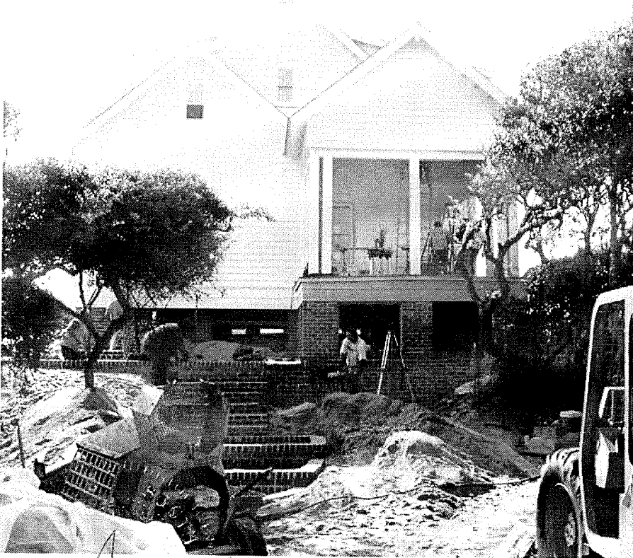
REAR VIEW 8/21/2014

If submitting more photographs than will fit on the preceding page, affix the additional photographs below. Identify all photographs with: date taken; "Front View" and "Rear View"; and, if required, "Right Side View" and "Left Side View." When applicable, photographs must show the foundation with representative examples of the flood openings or vents, as indicated in Section A8.