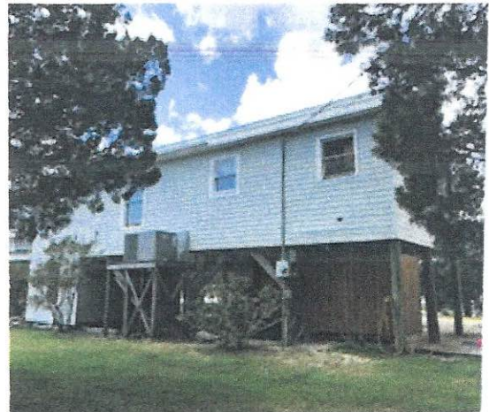
RIGHT SIDE (EAST)