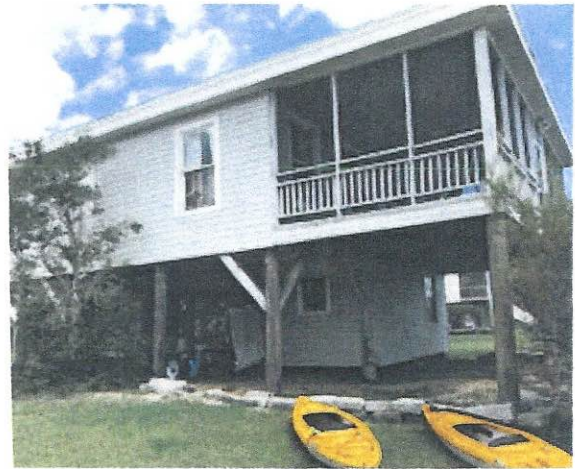
LEFT SIDE (WEST)