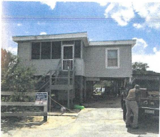
REAR (NORTH / STREET SIDE)