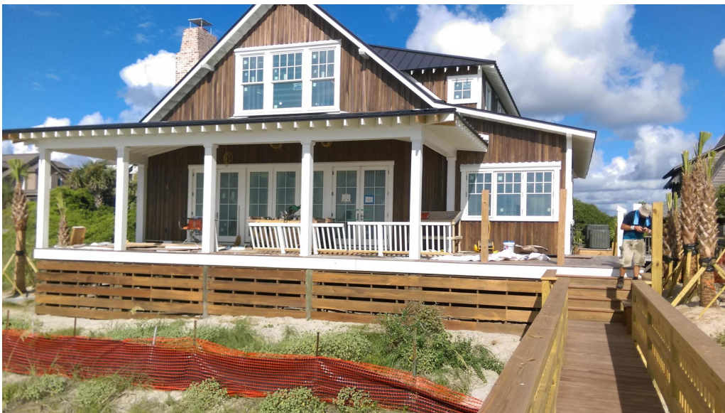
Rear View August 16, 2016