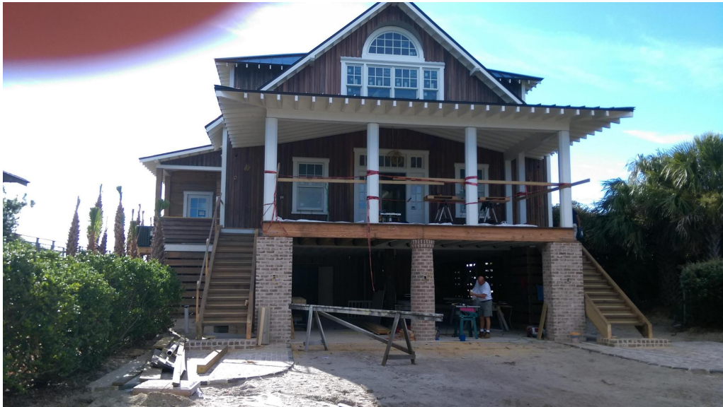
Front View August 16, 2016

If using the Elevation Certificate to obtain NFIP flood insurance, affix at least 2 building photographs below according to the instructions for Item A6. Identify all photographs with date taken; "Front view" and "Rear view"; and, if required, "Right Side View" and "Left Side View." When applicable, photographs must show the foundation with representative examples of the flood openings or vents, as indicated in Section A8. If submitting more photographs than will fit on this page, use the Continuation Page.