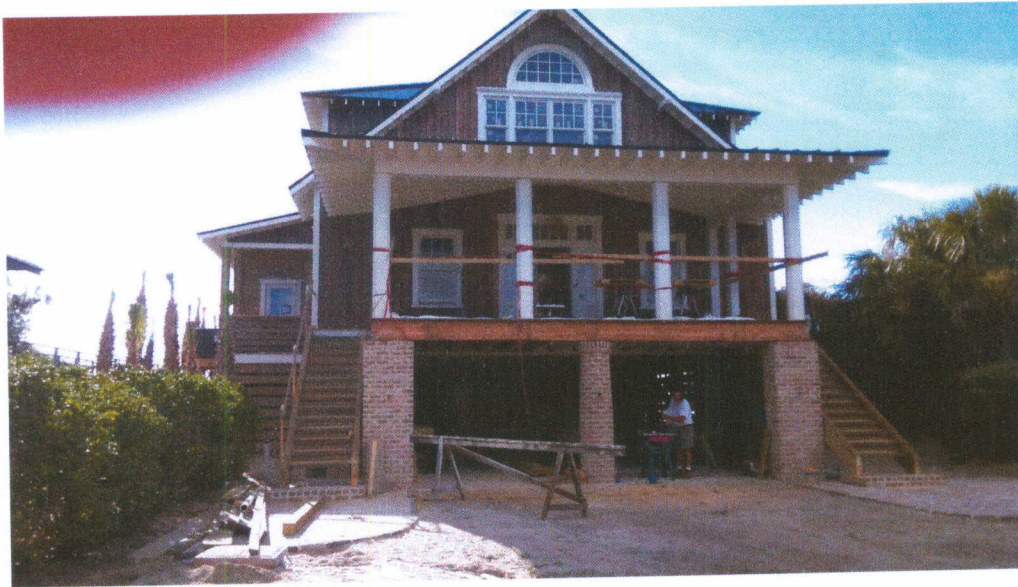
Front View August 16, 2016

If using the Elevation Certificate to obtain NFIP flood insurance, affix at least 2 building photographs below according to the instructions for Item A6. Identify all photographs with date taken; "Front view" and "Rear view"; and, if required, "Right Side View" and "Left Side View." When applicable, photographs must show the foundation with representative examples of the flood openings or vents, as indicated in Section A8. If submitting more photographs than will fit on this page, use the Continuation Page.