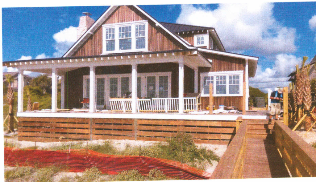
Rear View August 16, 2016